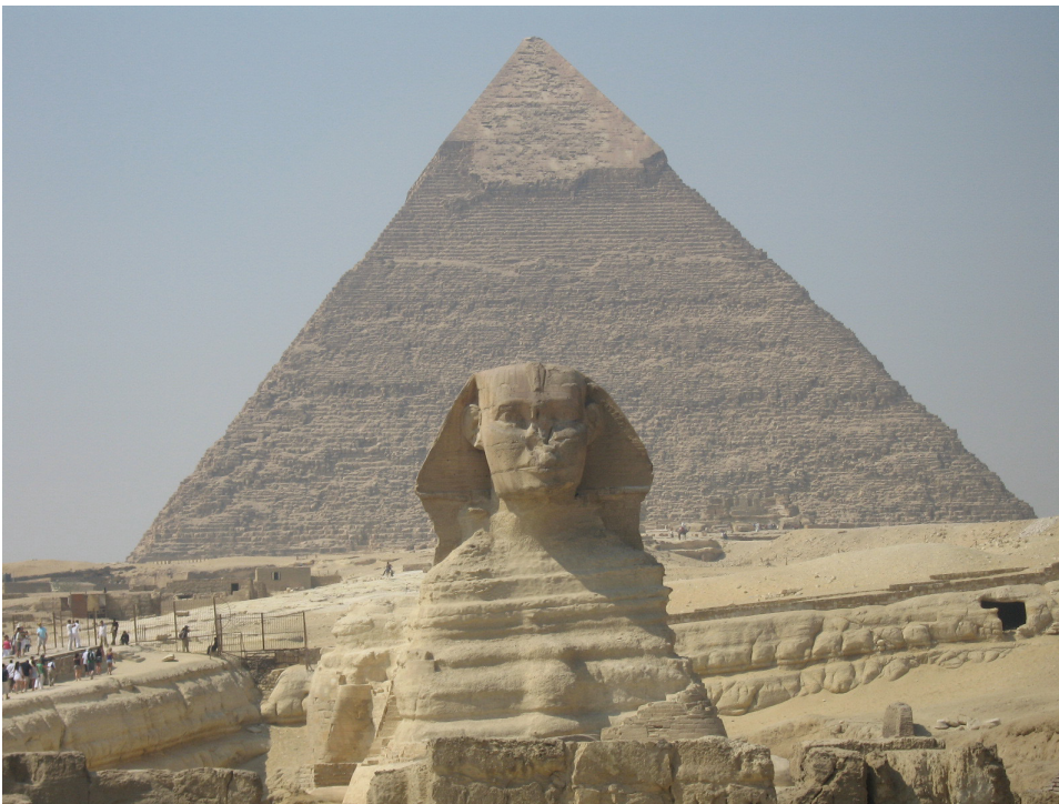
The Sphinx and Great Pyramid,