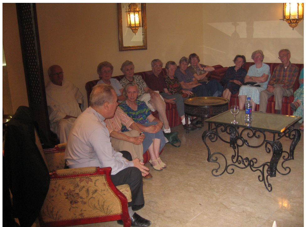
Archbishop Fitzgerald speaking to the group