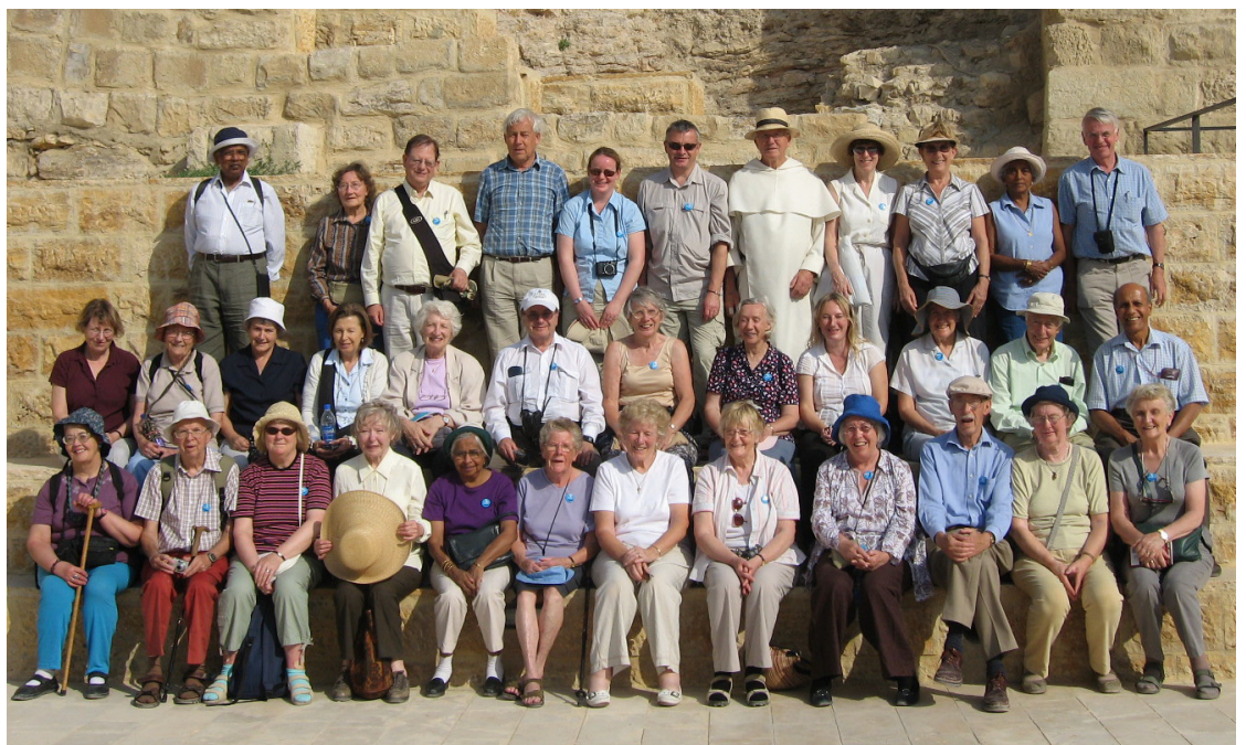
the pilgrims at Kerak Castle