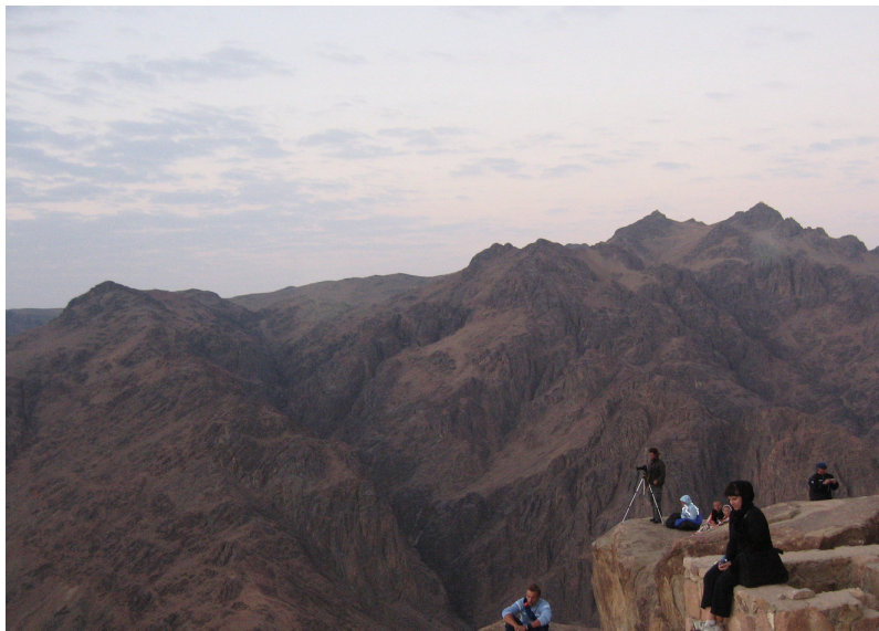
Waiting for sunrise on Mt Sinai