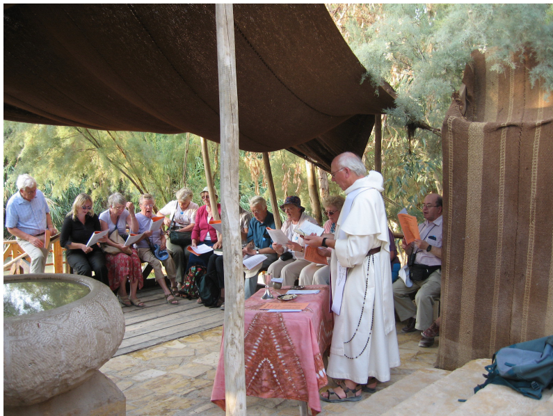
Mass beside the Jordan